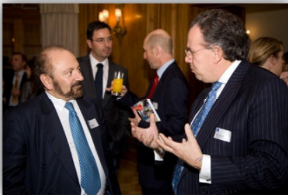
Champagne reception after a BSCC panel discussion at the Dorchester Hotel, London

The BSCC has invested 90 years in building a high quality business network across Switzerland and the United Kingdom. This provides BSCC members with an effective means of forming new contacts within the international business community.