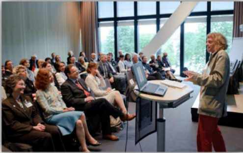
Grayson Perry, Artist and Turner Prize winner, sharing his thoughts at the BSCC / COBCOE Art Basel Seminar 2010

The BSCC organises over 70 informative and entertaining business events per year at prestigious venues. Speakers are carefully selected and include leading representatives of the British, Swiss and international business, political and cultural communities.